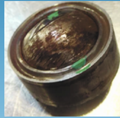
MS BEARING after 2 million cycles