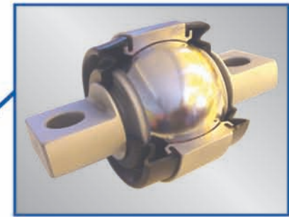
Self-lubricating Bearing Assemblies for Torsion Bar Links and Anti-roll Bar Connecting Rods